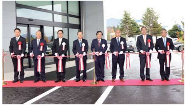
NHK Spring representatives attending the completion ceremony