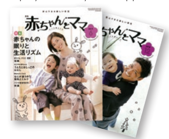
Akamama mother and child magazine

Additionally, as part of the child-care support from fiscal 2019, we have begun to distribute the Akamama mother and child magazine to anyone applying for maternity benefits who would like a subscription.