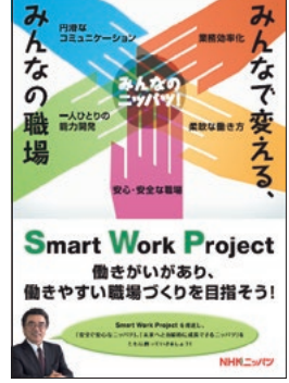
Company-wide enlightenment activities through posters (the picture is of the NHK Spring President)