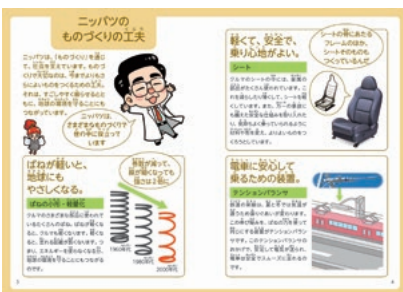
The Kayamon character modeled after the President of NHK Spring used in the booklet for children that introduces NHK Spring

We have created a booklet for children to introduce information about NHK Spring. In addition to explaining where NHK Spring products are used, this booklet provides an overview of our environmental conservation activities. This booklet is handed out at events for children as NHK Spring receives even more requests for tours from students in elementary and other schools. In the future, we will use this booklet as one of the tool to help bring understanding about our company.