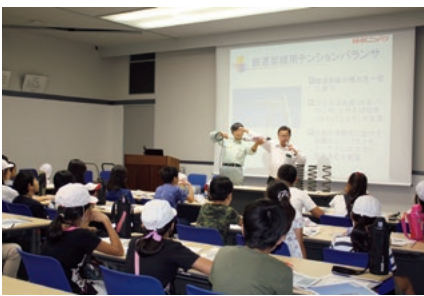
Elementary school students listening to an explanation about NHK Spring products

We have also published and used a booklet for children to introduce information about NHK Spring.