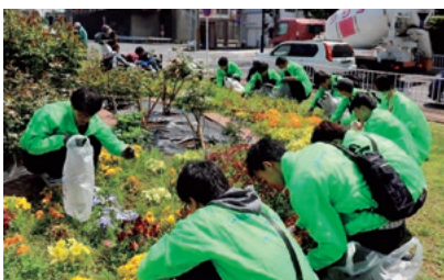
New employees participating in beautifying Mitsuzawa Park

On April 22, 2018, we conducted a beautification activity in Mitsuzawa Park in Yokohama City before watching an official J. League match between Yokohama FC and Tochigi SC. 106 people, including employees of the Yokohama Office and their families as well as 52 new employees who joined NHK Spring this fiscal year, participated in the event. During the activity, participants pulled weeds in flower beds and around shrubbery as a way to help beautify the park. During the soccer match, participants were able to watch players practice right next to the field and take commemorative photographs. At half-time, everyone watching was introduced to visit on the main screen there. We will actively continue to contribute to the local community in the future.