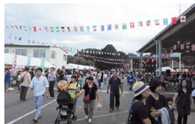
Many people visited summer festival

On September 1, 2018, we held our annual summer festival at the Sumihatsu Tsukuba Plant with more than 1,400 people participation, including employees, their families, and people from the local community. Every year, Sumihatsu invites talented celebrities. This year Kaminari, a duo originally from Ibaraki prefecture, energized the event with comedy about the local area. In addition to a mimicry, superhero, and a magic shows, everyone who attended was also entertained by an employee competition, a drawing and various other programs. In the future, we will continue to strive to be a company rooted in the local community.