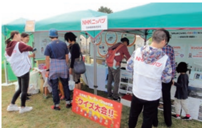
Bustling NHK Spring workshop

120 members of NHK Spring provided sports drinks, sugar candy, and chocolate to the about 27,000 runners while cheering each runner on.