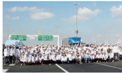
All of the volunteers who invigorated the event with passionate cheers

120 members of NHK Spring provided sports drinks, sugar candy, and chocolate to the about 27,000 runners while cheering each runner on.