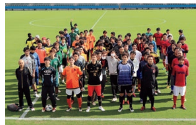
100 people, including employees and their families, came to cheer at the event

We held a soccer competition with the goal of cultivating a sense of unity throughout the NHK Spring Group.