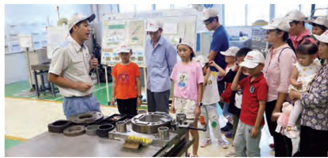
Employees guide families through their own workplace

In October 2019, NHK Spring Precision (Guangzhou) (NSPG), a Group company in China, held a Family Interaction Event each year, employees' families are invited to commemorate the anniversary of the company's founding in an event that includes introductions of the company, its products, plant tour, and games. This was the fifth time the event had been held. In the plant tour, employees engaged in the work themselves provided detailed explanations of the production process. Families were asked to give their impressions for the first time at this event, and comments included such remarks as, "I'm filled with gratitude that this kind of event could be put on for us." Moving forward, we hope that by having employees join their families in seeing, hearing and experiencing such an enjoyable time together at these Family Interaction Gathering events will help raise awareness of employees.