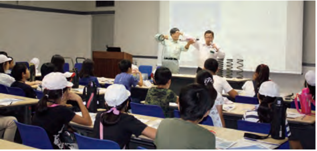
Elementary school students listening to an explanation about NHK Spring products

We have also published and used a booklet for children to introduce information about NHK Spring.