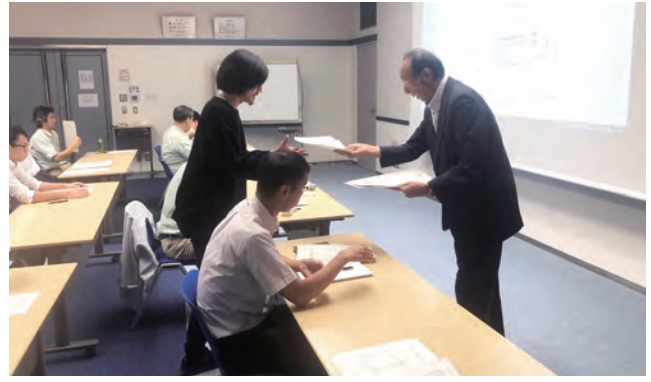
Internal Environmental Auditor training courses (environmental education, FY2019) *Courses cancelled during FY2020 and FY2021 due to the COVID-19 pandemic.