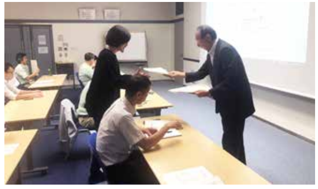
Internal Environmental Auditor training courses (environmental education, when held in FY2019) *Courses cancelled during FY2020 and FY2021 due to the COVID-19 pandemic, but have been held remotely since FY2022 via Microsoft Teams etc.