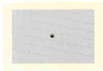
Probe Head detail